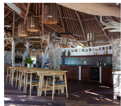
TABLE OF FACTS