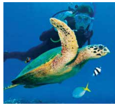
TABLE OF FACTS