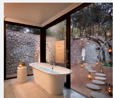
TABLE OF FACTS