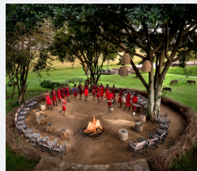
TABLE OF FACTS